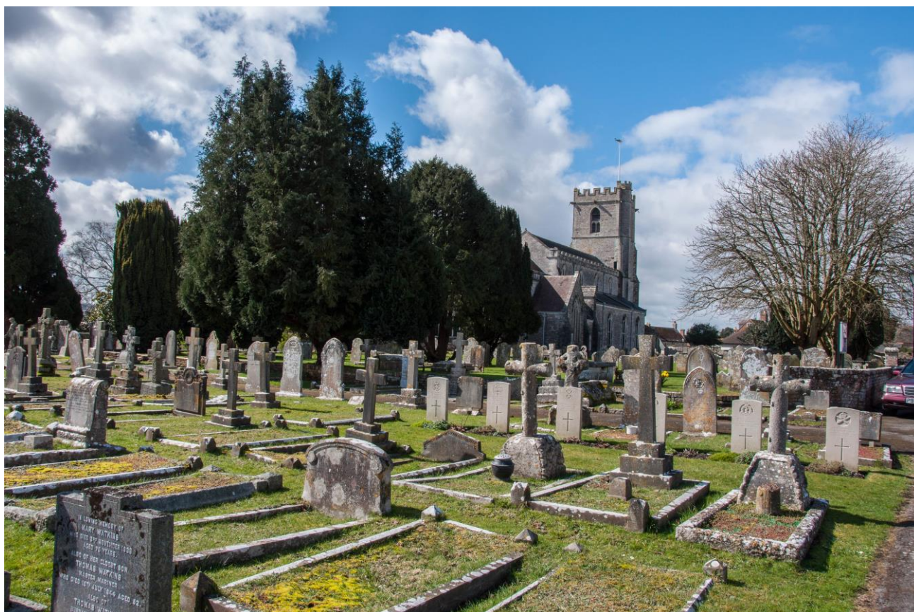
Wareham Cemetery, Wareham

Wareham Cemetery, Wareham, Dorset contains 71 Commonwealth War Graves. Wareham Military Hospital, with 185 beds, was at Worgret Camp during the First World War and the regimental depot of the Royal Armoured Corps was at nearby Bovington during the Second World War. Wareham Cemetery contains 49 First World War burials and 15 from the Second World War, 5 being unidentified. The cemetery also contains 12 German burials, 1 being an unidentified airman. (Information from CWGC)