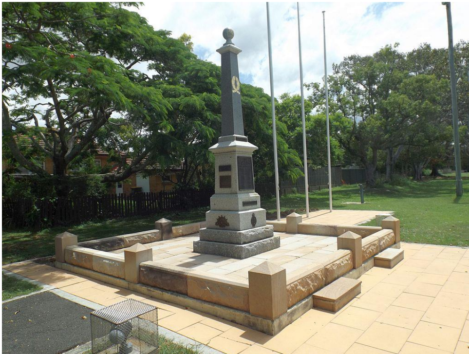
Graceville War Memorial