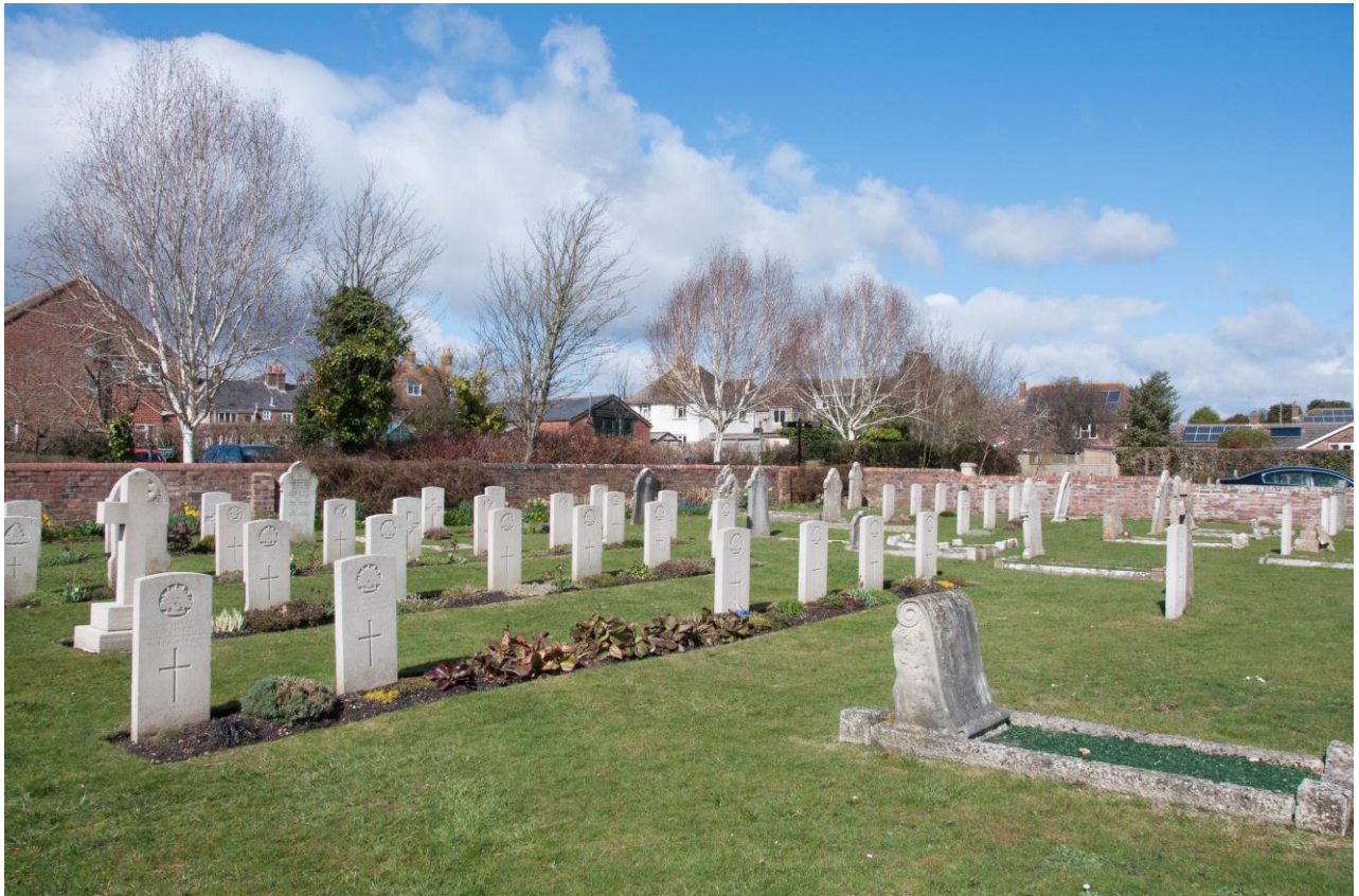
Wareham Cemetery, Wareham